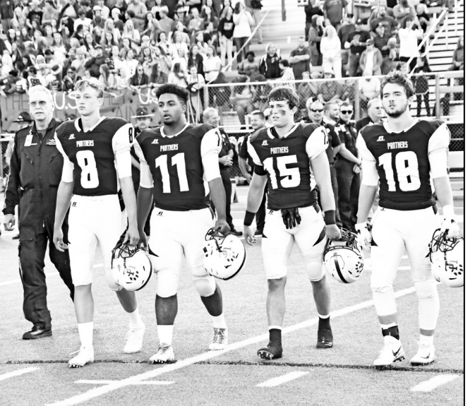
The Union Co. captains escorted by first responders.