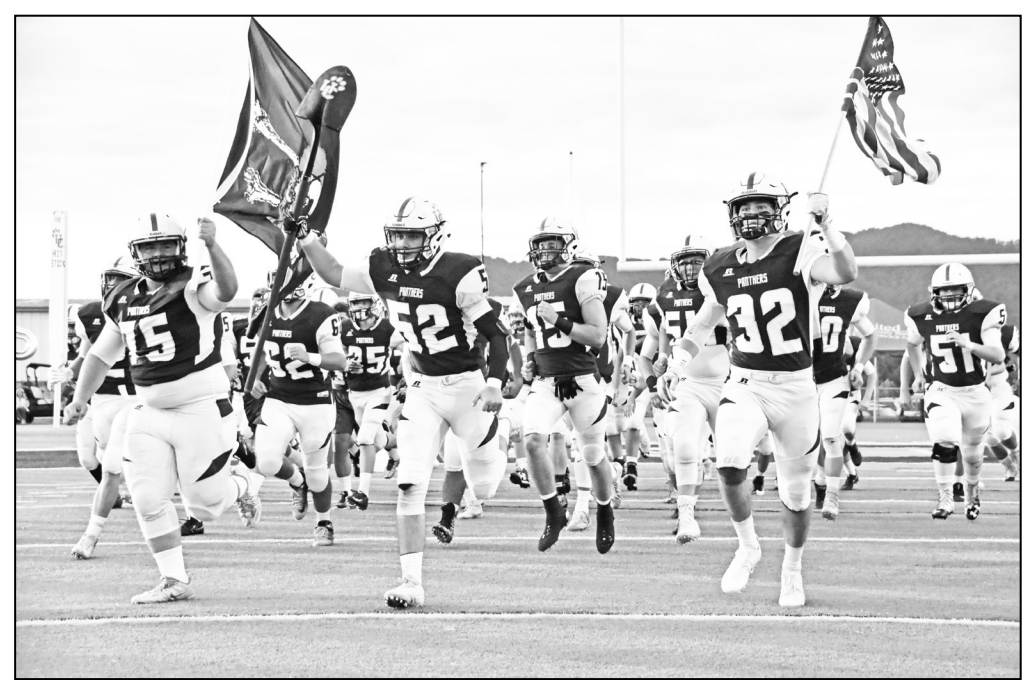
The Panthers take the field prior to their 42-14 victory over Andrews, NC on Friday.